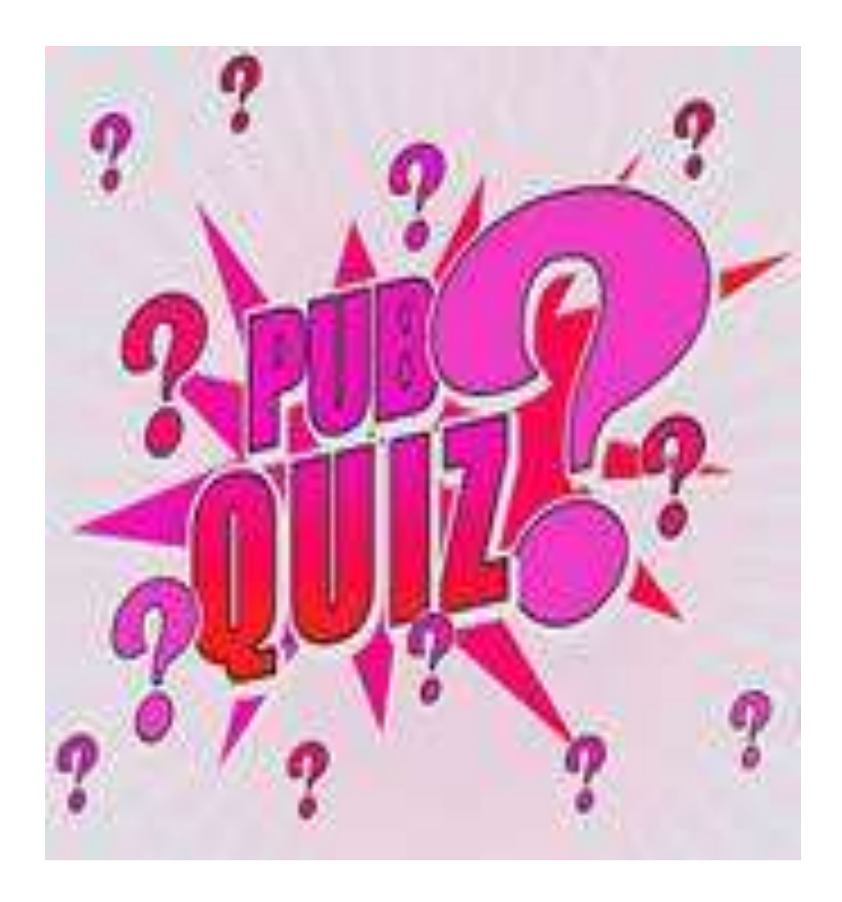
Friends of North Crawley School - Quiz Night

Sunday 24<sup>th</sup> April 2016 At the The Cock Public House, North Crawley